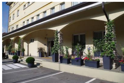
Best Quality Hotel La Darsena Str. Torino, 29, 10124 Moncalieri TO Telefono: 011 642448