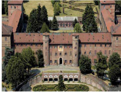
Entrance in Viale del Castello, 2 Moncalieri